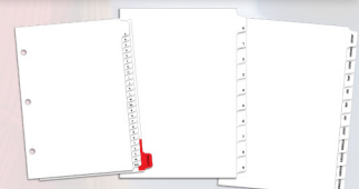
3870 3871 3872 Ringbook Dividers