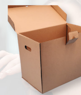
3880 File Folder Storage