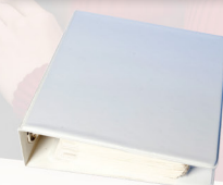
3873 Ringbook Binder