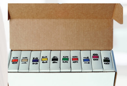
3879 Dispenser Box Only