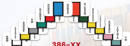
386-XX Ringbook only Auto Make